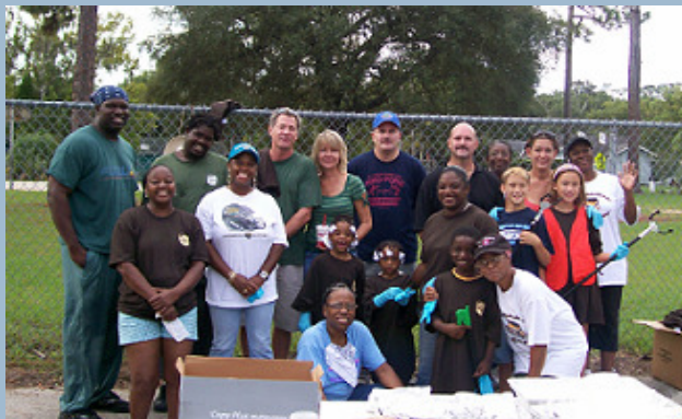
Above and Left: UPS partners with Grace & Truth CDC for a Clean Up Day and Community Planting in North Brookside.